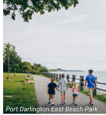
Port Darlington East Beach Park