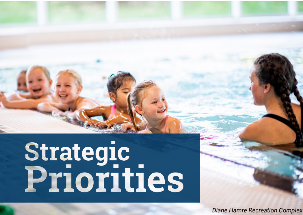
Diane Hamre Recreation Complex