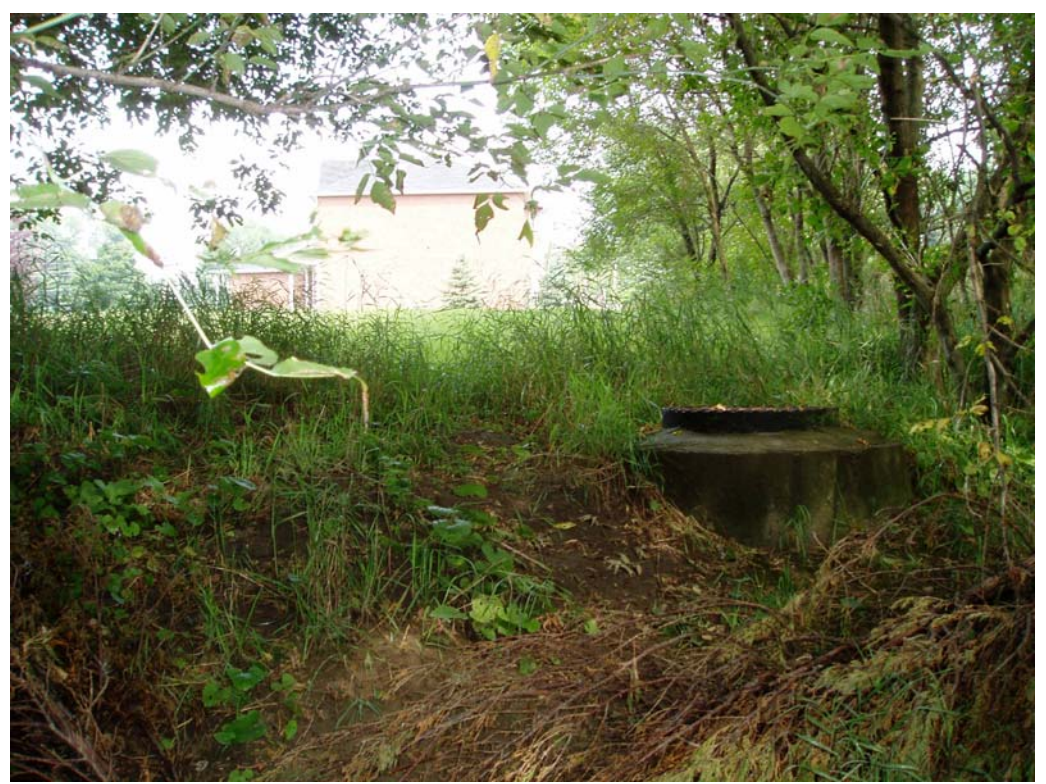
Plate 1: Looking east at sloping area immediately west of landscaped area