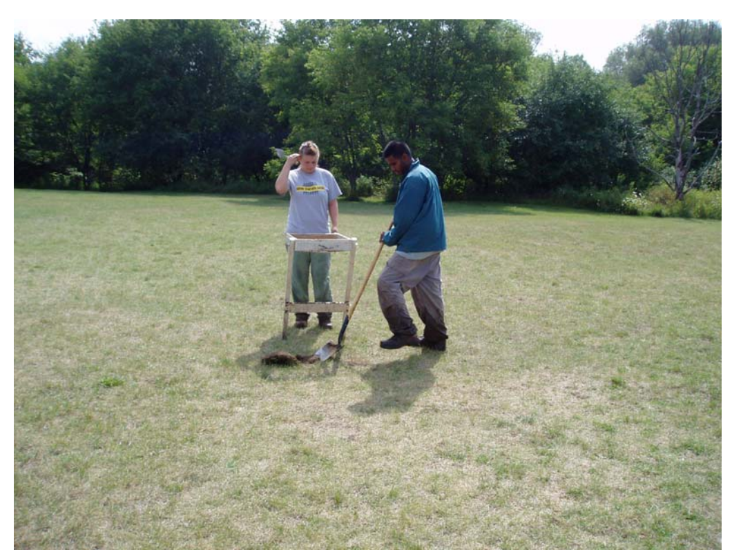
Plate 3: Looking west at test-pit survey of area immediately west of existing Grady Drive (disturbed)