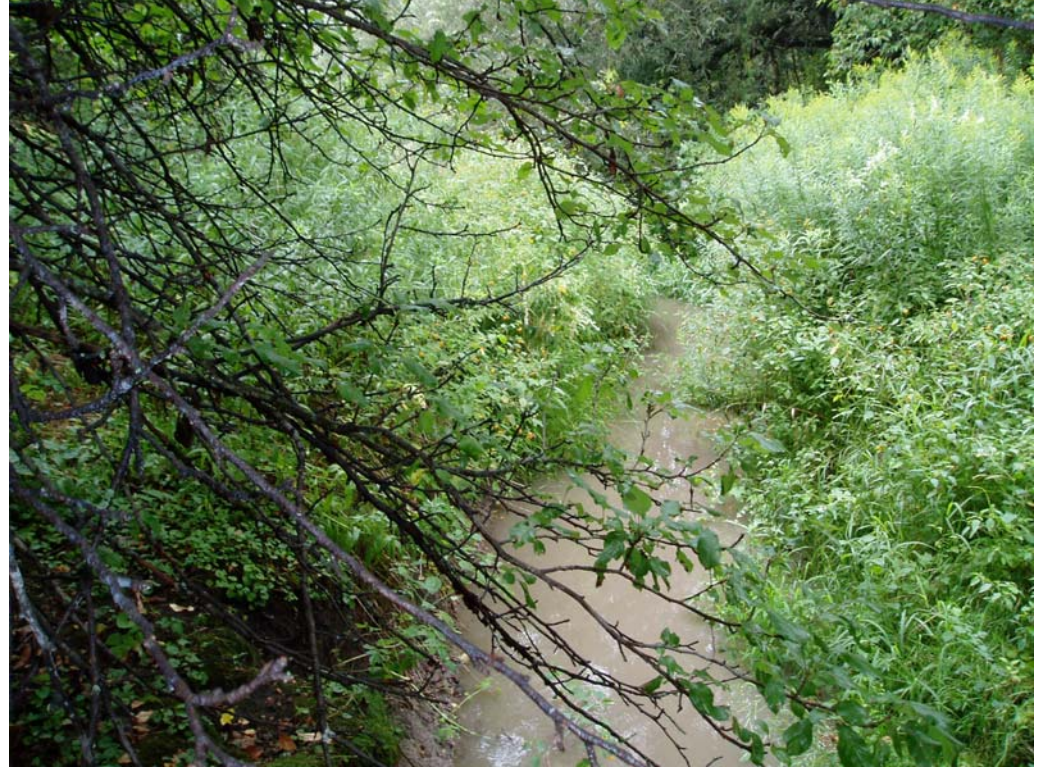
Plate 2: Looking north at Foster Creek