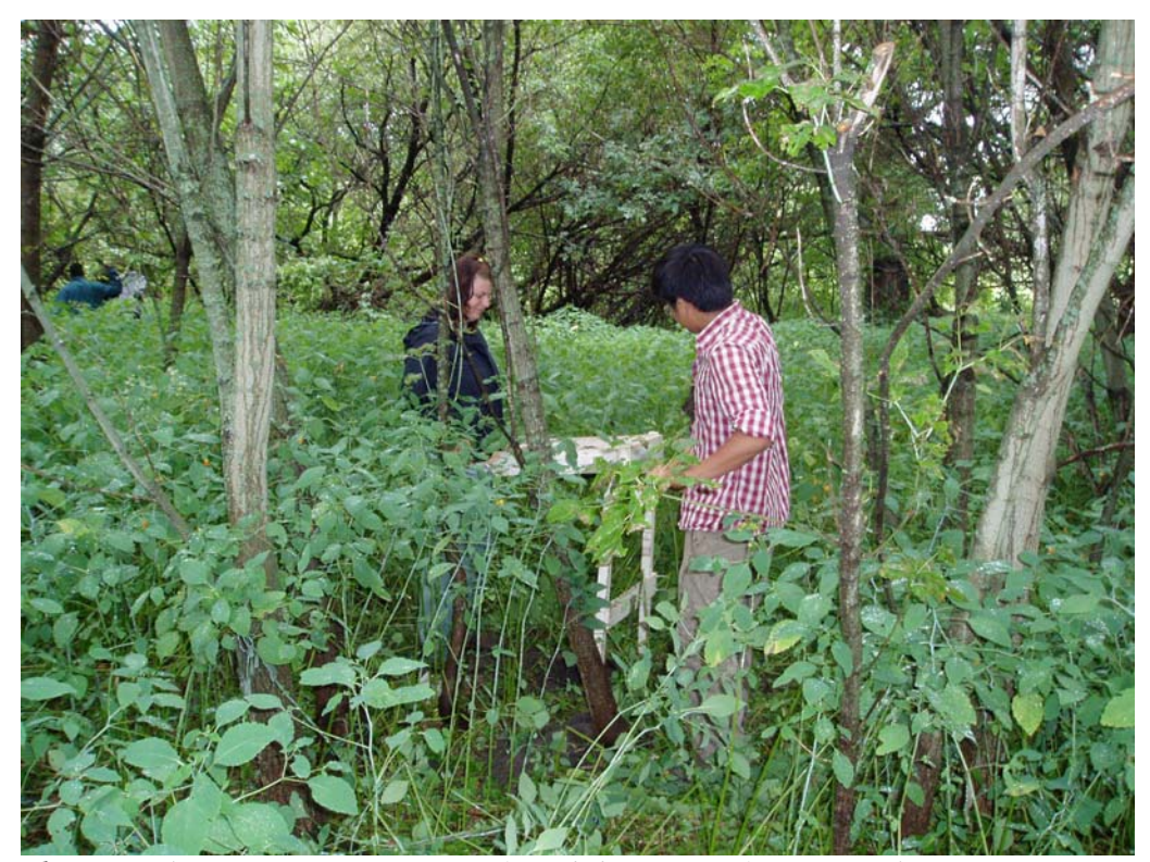
Plate 5: Looking west at test-pit survey of wooded area east of Foster Creek