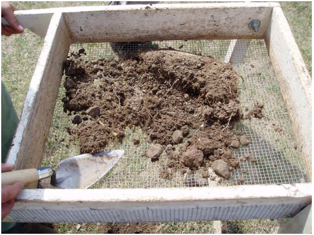
Plate 4: Looking at disturbed soil (landscaping fill)