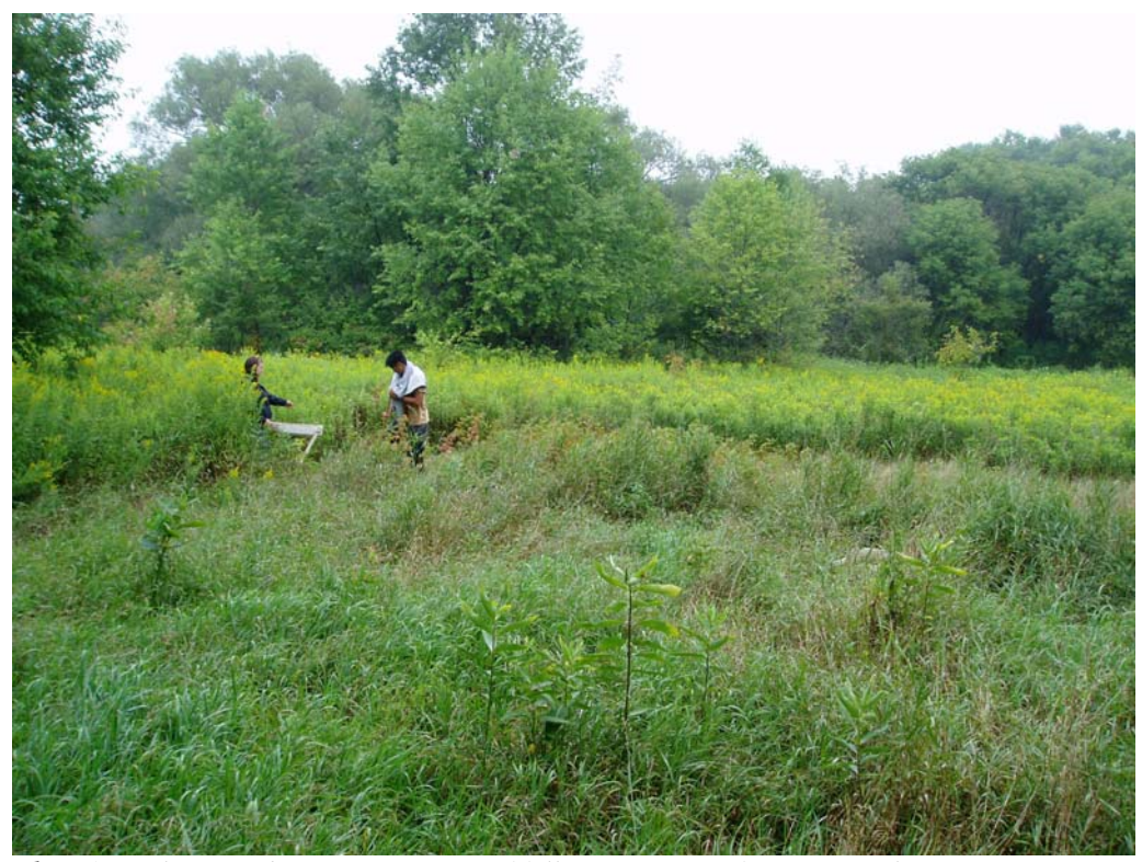
Plate 6: Looking north at test-pit survey of fallow area west of Foster Creek