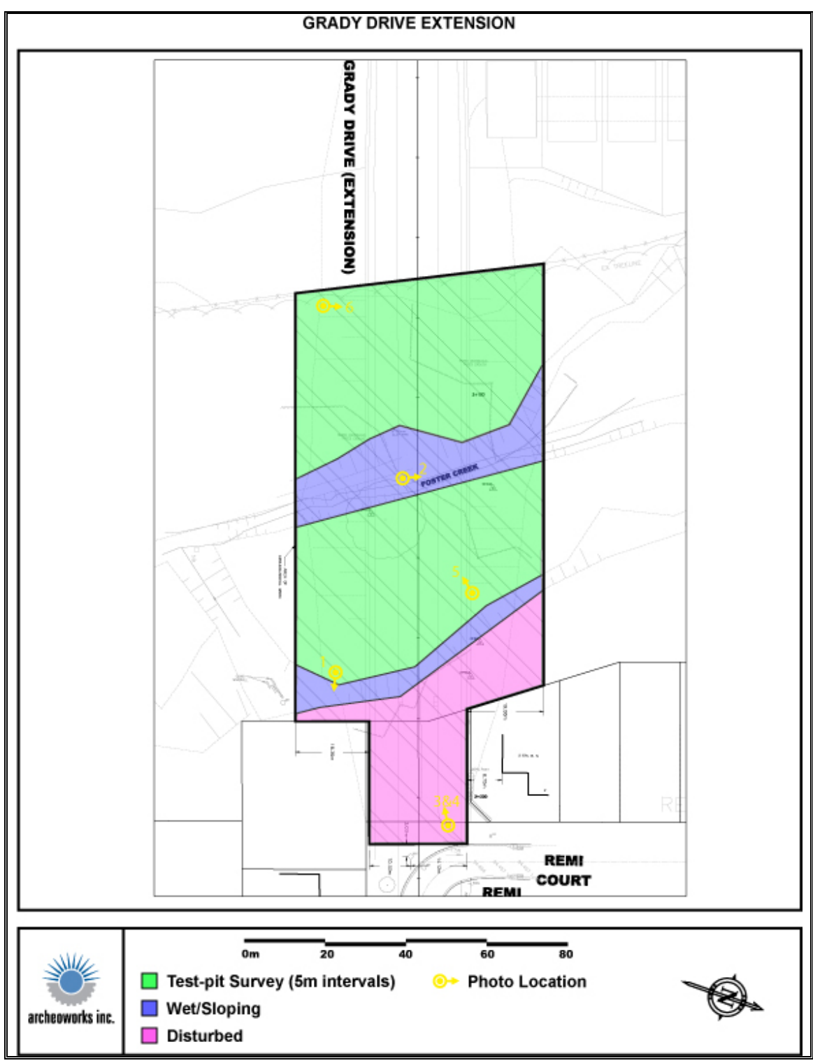
Figure 3: Stage 2 Archaeological Assessment