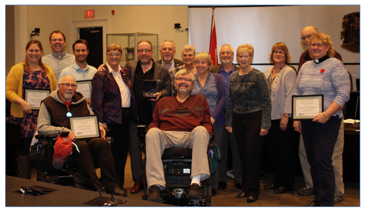
Figure 1 Accessibility Advisory Committee and Clarington nominees for Durham Region Accessibility Award