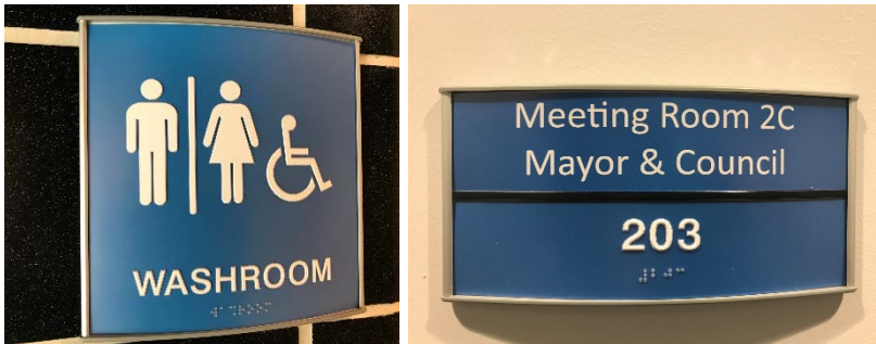
Figure 1 – Accessible wayfinding sign and accessible office sign