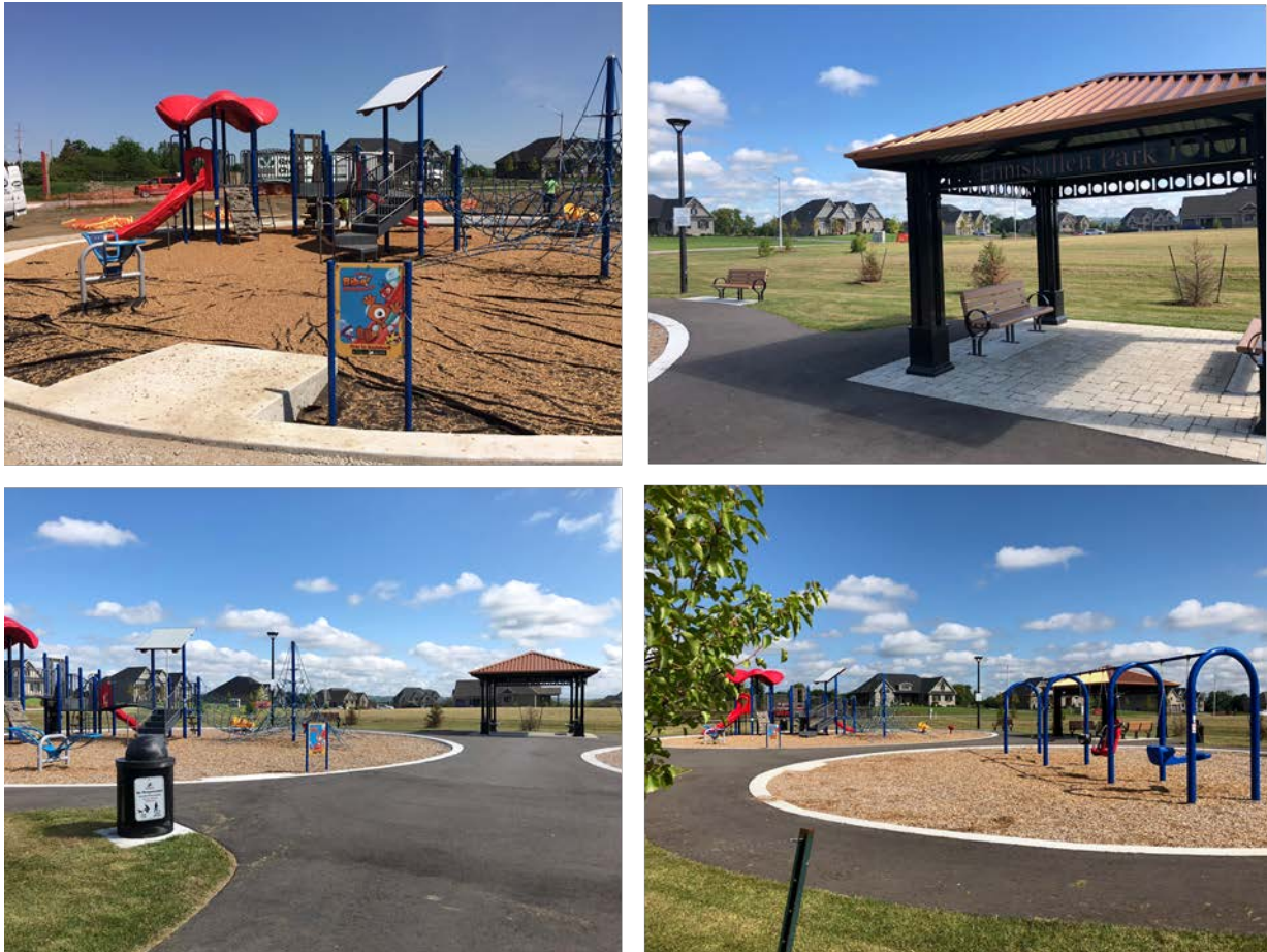
Figure 3 – Enniskillen Park showing ramp access to the playground prior to the addition of wood fibre surface (top left), rest areas (top right), paved pathway (bottom left) and accessible swing seat (bottom right).

3.32 The development of Enniskillen Park was also completed in 2018. Some of the accessible features of the playground areas are: concrete access ramps, wood fiber surfaces, and an accessible swing seat. Several accessible play components are at ground level and others can be accessed from the transfer station. The park is relatively flat and all of the walkways are paved. Rest areas include extended bench pads to allow space for a wheelchair, mobility device or stroller adjacent to the bench.