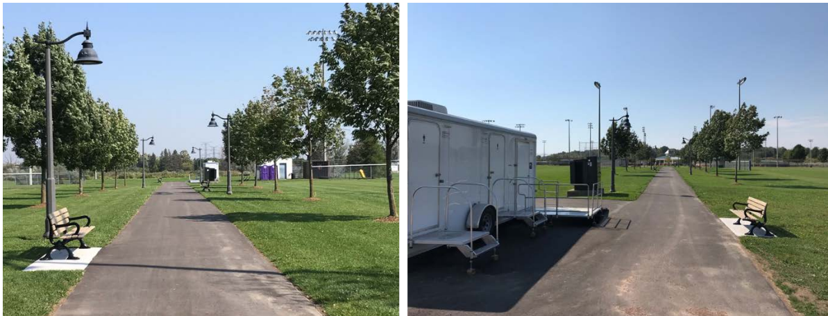
Figure 2 – Clarington Fields showing view of the paved pathway from the baseball fields (left) and the view from the seasonal accessible washroom trailer (right).